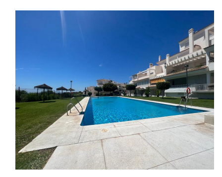
Río Real Apartment