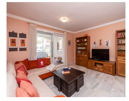
Ref.-ID: R4718761 Marbella