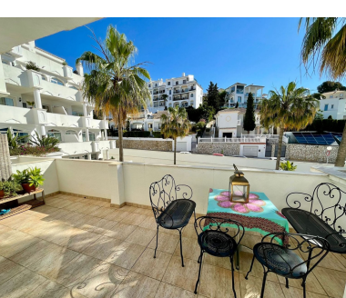
Ref.-ID: R4721590 Riviera del Sol