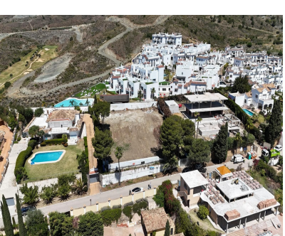
Ref.-ID: R4732693 Benahavís Plot