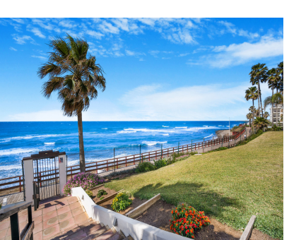
Ref.-ID: R4742275 Mijas Costa