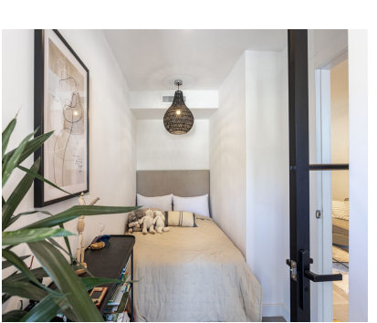
Ref.-ID: R4743745 The Golden Mile