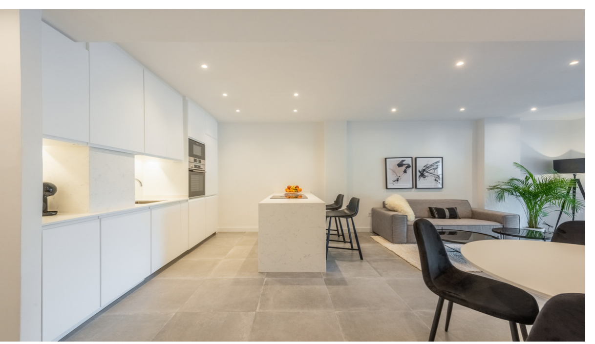
The Golden Mile

IBI: 898 EUR / year Rubbish: 185 EUR / year