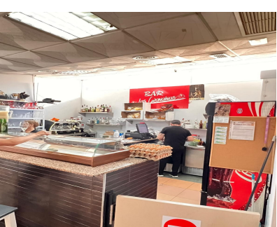
Ref.-ID: R4762117 Estepona Commercial