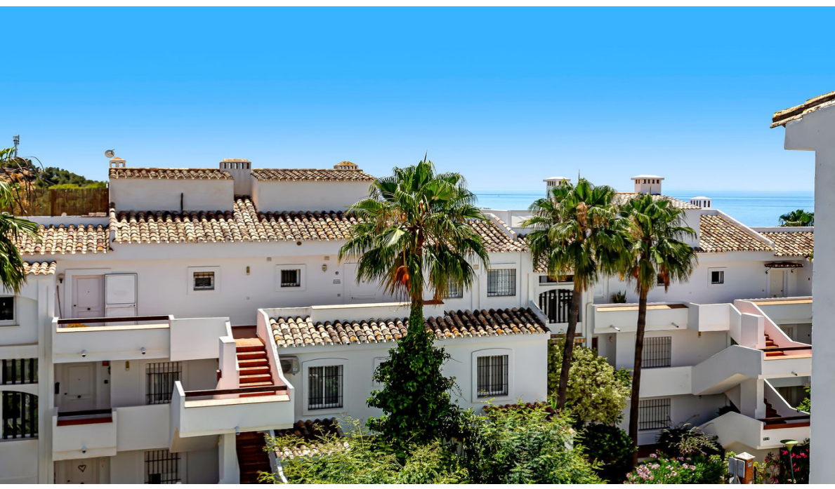
Riviera del Sol

IBI: 346 EUR / year Rubbish: 81 EUR / year