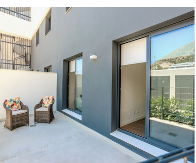
Ref.-ID: R4771903 Fuengirola

Community: 3,000 EUR / year IBI: 602 EUR / year