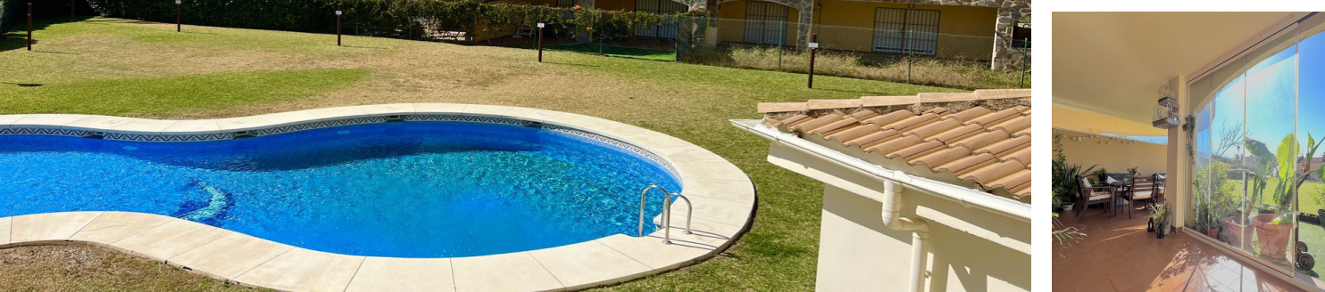
Ref.-ID: R4774618 Fuengirola Apartment