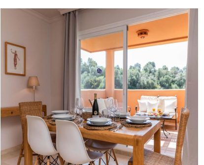
Community: 1,368 EUR / year