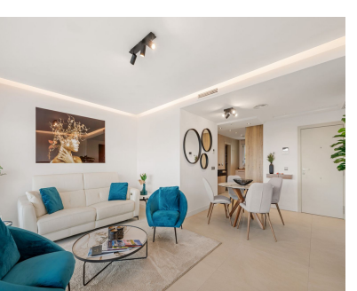
Ref.-ID: R4801585 La Cala Golf