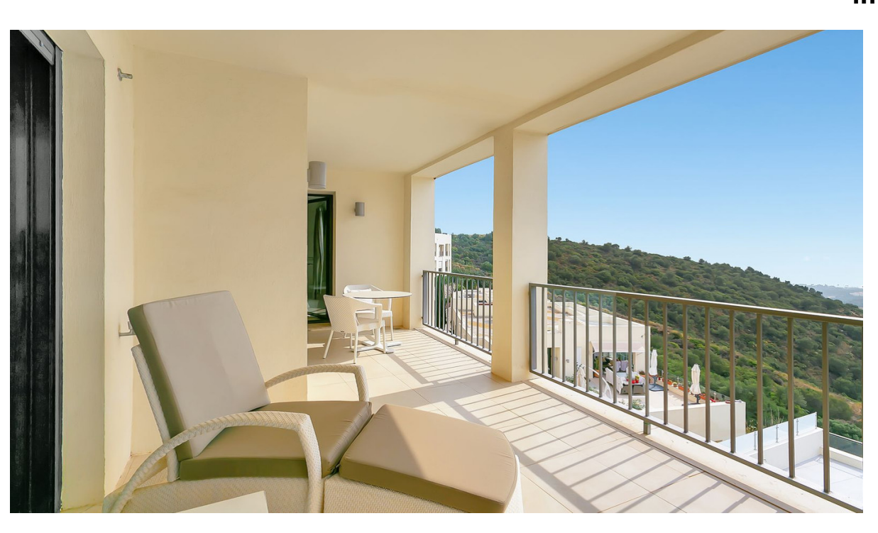
Altos de los Monteros