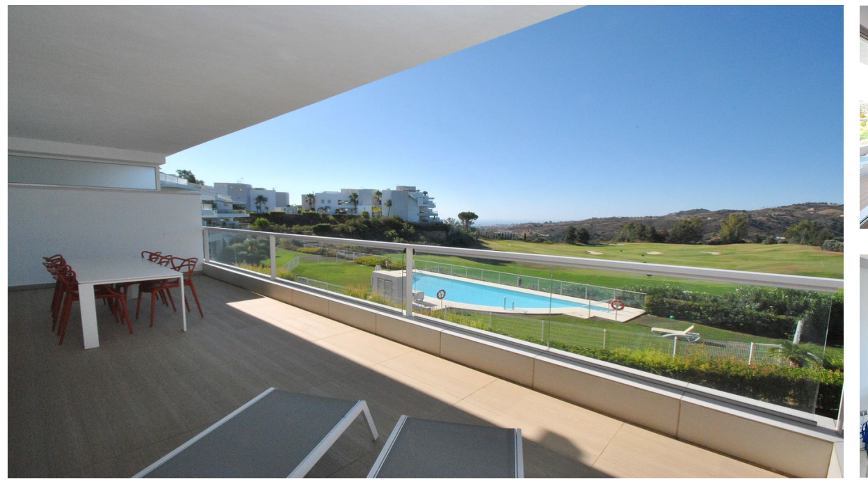
La Cala Golf