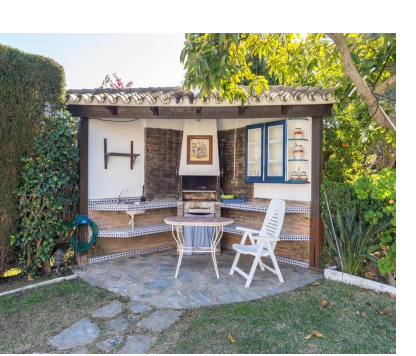
Ref.-ID: R4803886 Bel Air