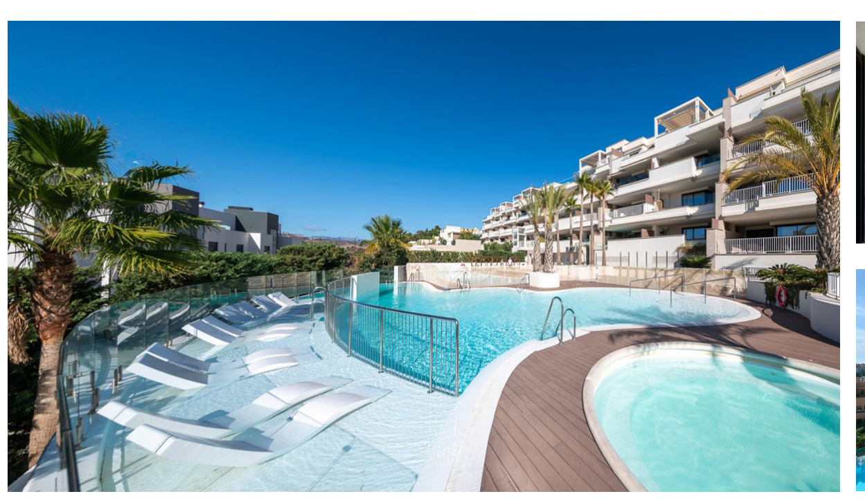
La Cala de Mijas