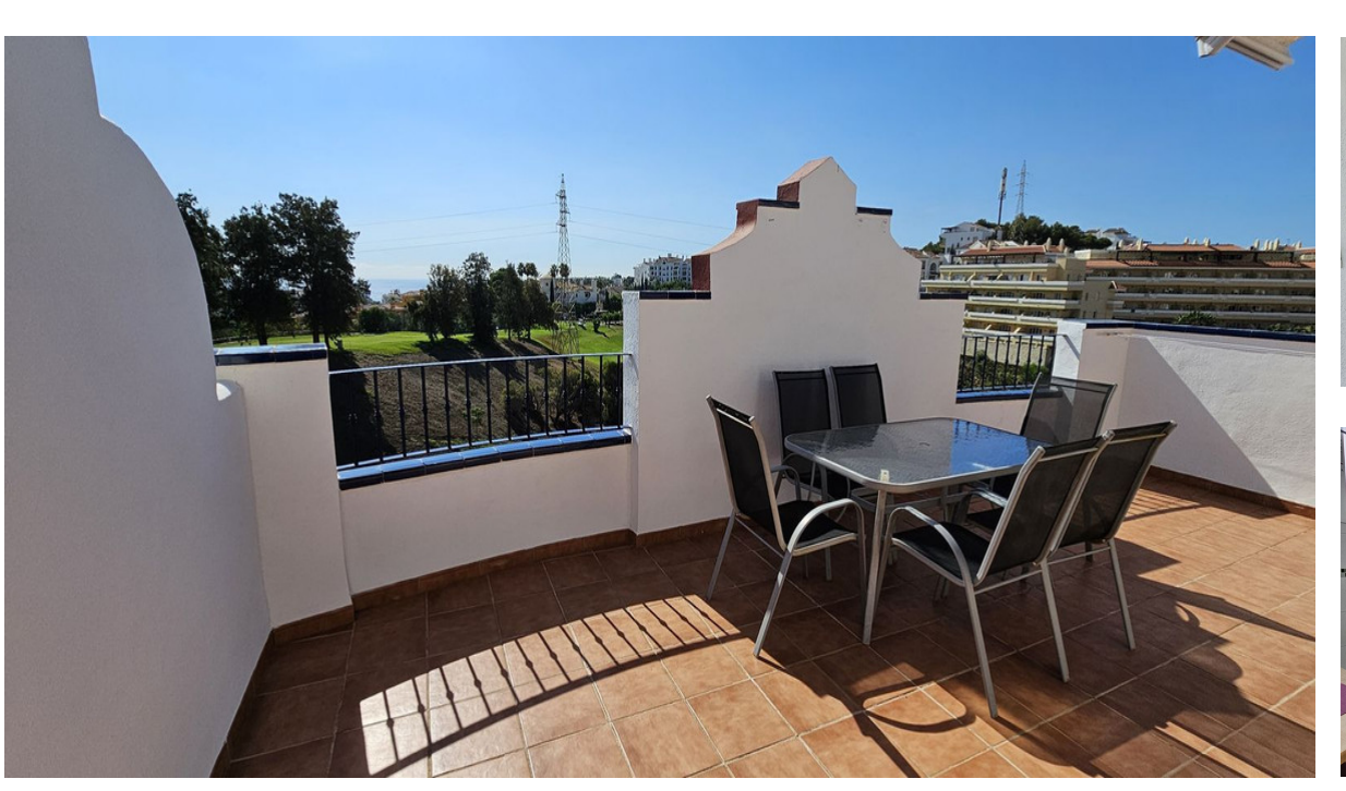
Riviera del Sol

IBI: 361 EUR / year Rubbish: 82 EUR / year