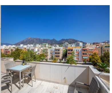
Ref.-ID: R4821808 Marbella

IBI: 86 EUR / year Rubbish: 33 EUR / year