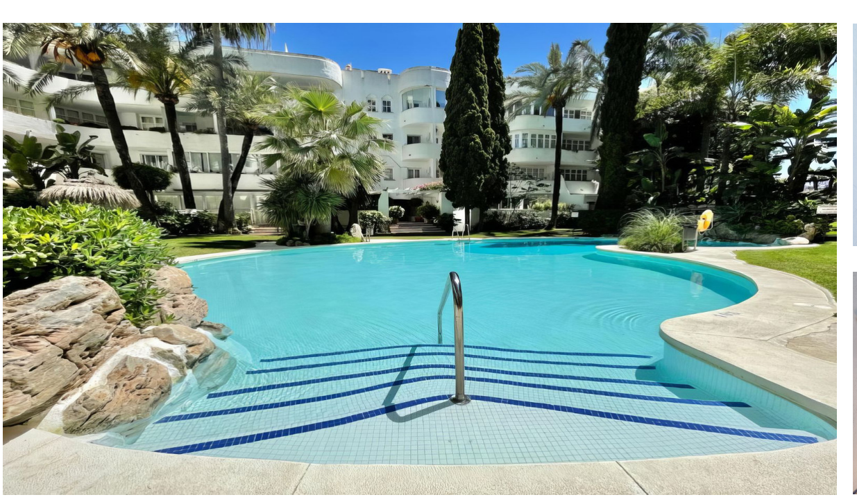
The Golden Mile