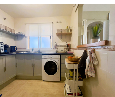
Ref.-ID: R4829710 Calahonda