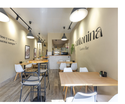
Ref.-ID: R4835884 Marbella Commercial