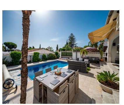
Ref.-ID: R4837612 El Chaparral