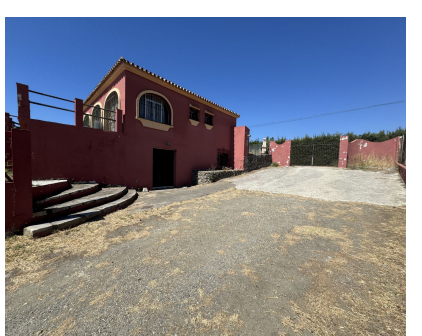
IBI: 3,600 EUR / year