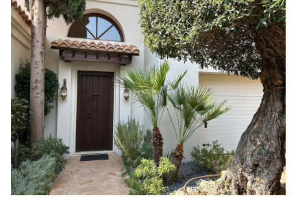
Ref.-ID: R4839898 Estepona