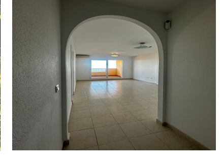
Ref.-ID: R4840234 Riviera del Sol