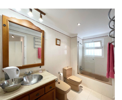
Ref.-ID: R4842382 Fuengirola