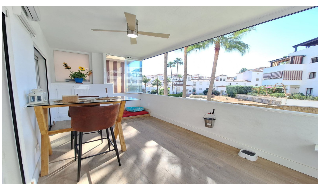
Riviera del Sol