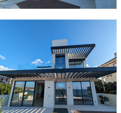
Ref.-ID: R4851256 Estepona