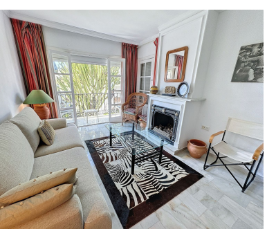
Ref.-ID: R4851541 Mijas