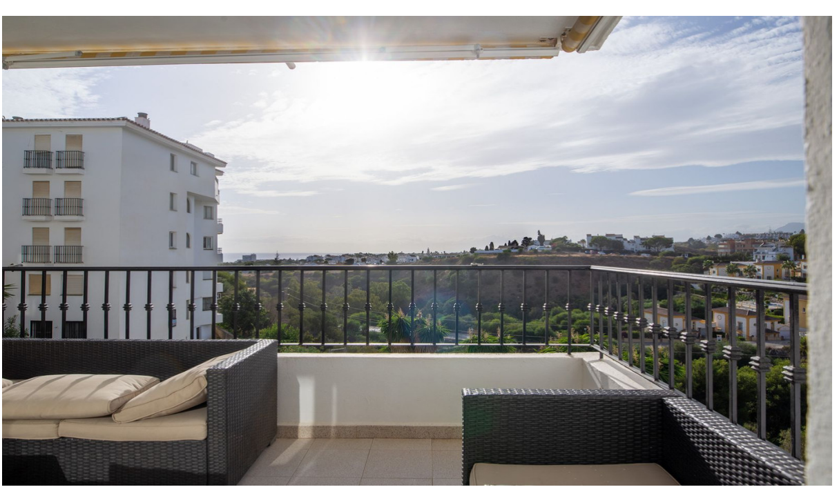
Riviera del Sol