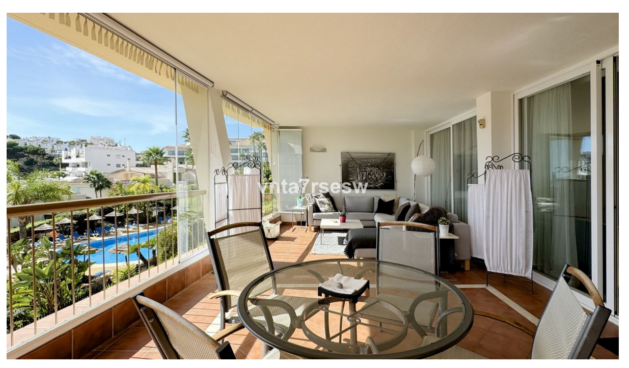
Riviera del Sol