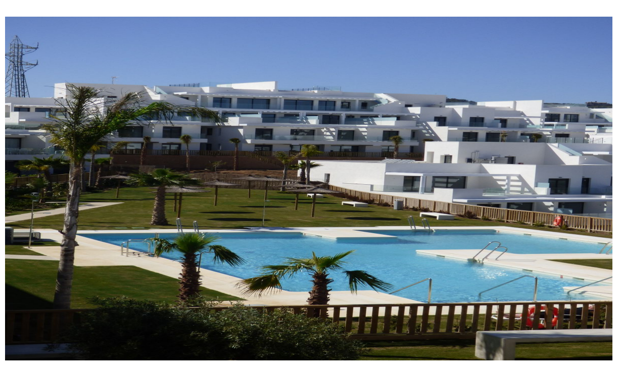
La Cala de Mijas

IBI: 905 EUR / year Rubbish: 110 EUR / year