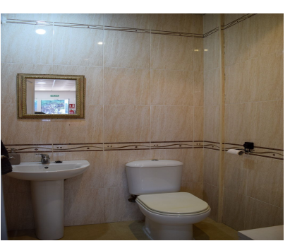
Ref.-ID: R4864186 Mijas Costa Commercial