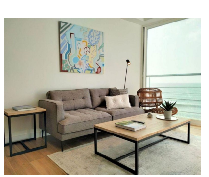
Ref.-ID: R4866787 Benalmadena