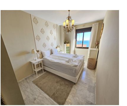
Ref.-ID: R4866874 Benalmadena Costa