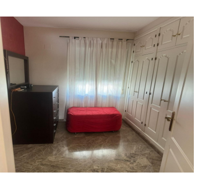
Ref.-ID: R4868434 Torremolinos

IBI: 865 EUR / year Rubbish: 260 EUR / year