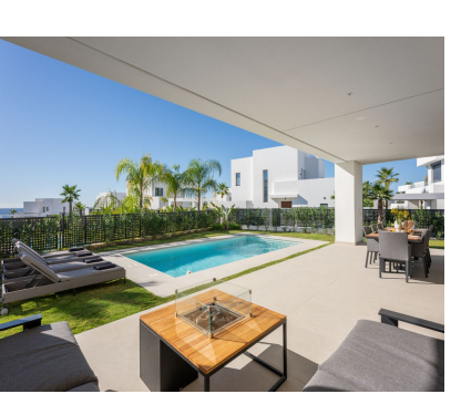
Community: 4,080 EUR / year