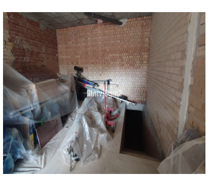
Ref.-ID: R4876171 Cabopino Commercial