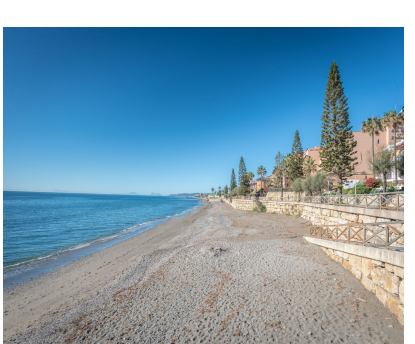
Ref.-ID: R4876537 Estepona