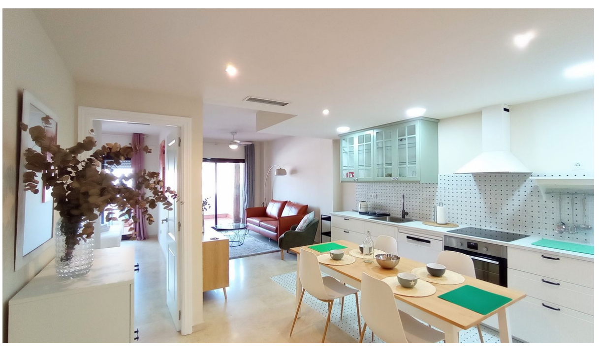
Riviera del Sol

IBI: 410 EUR / year Rubbish: 80 EUR / year