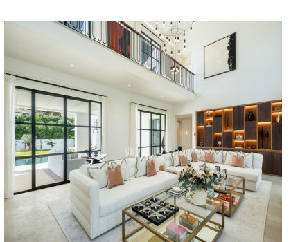
The Golden Mile