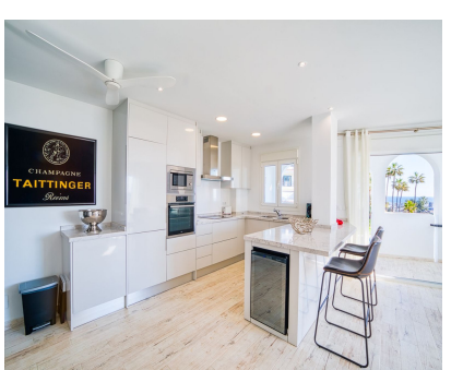
Community: 1,980 EUR / year