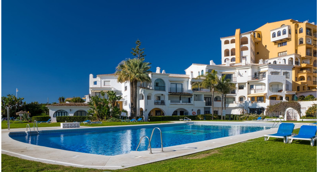
Puerto de Cabopino

IBI: 1,500 EUR / year Rubbish: 180 EUR / year