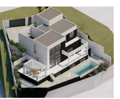
Ref.-ID: R4885483 Bel Air Plot