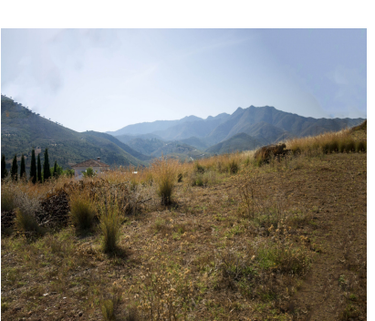
Ref.-ID: R4887118 Campo Mijas