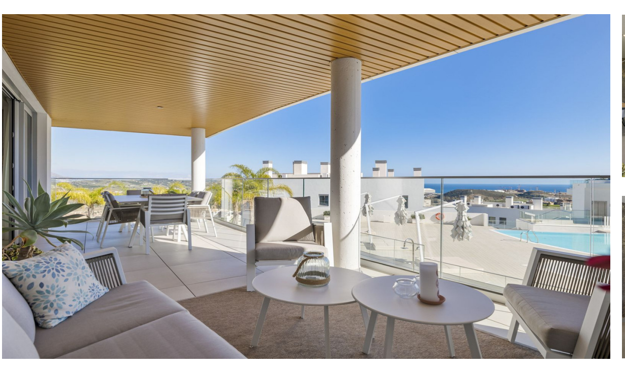
La Cala de Mijas