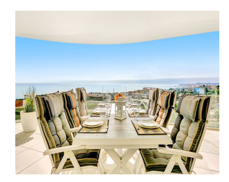
Ref.-ID: R4891492 Fuengirola