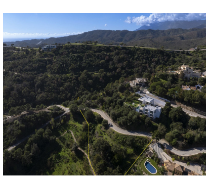
Ref.-ID: R4891933 Benahavís Plot