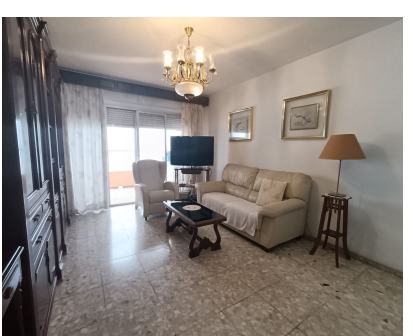
Ref.-ID: R4892017 Marbella Apartment