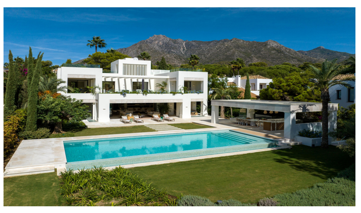
The Golden Mile